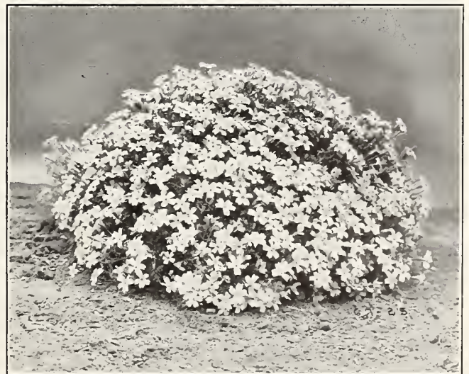
MARIGOLD SIGNATA PUMILA, OR BORDER MARIGOLD